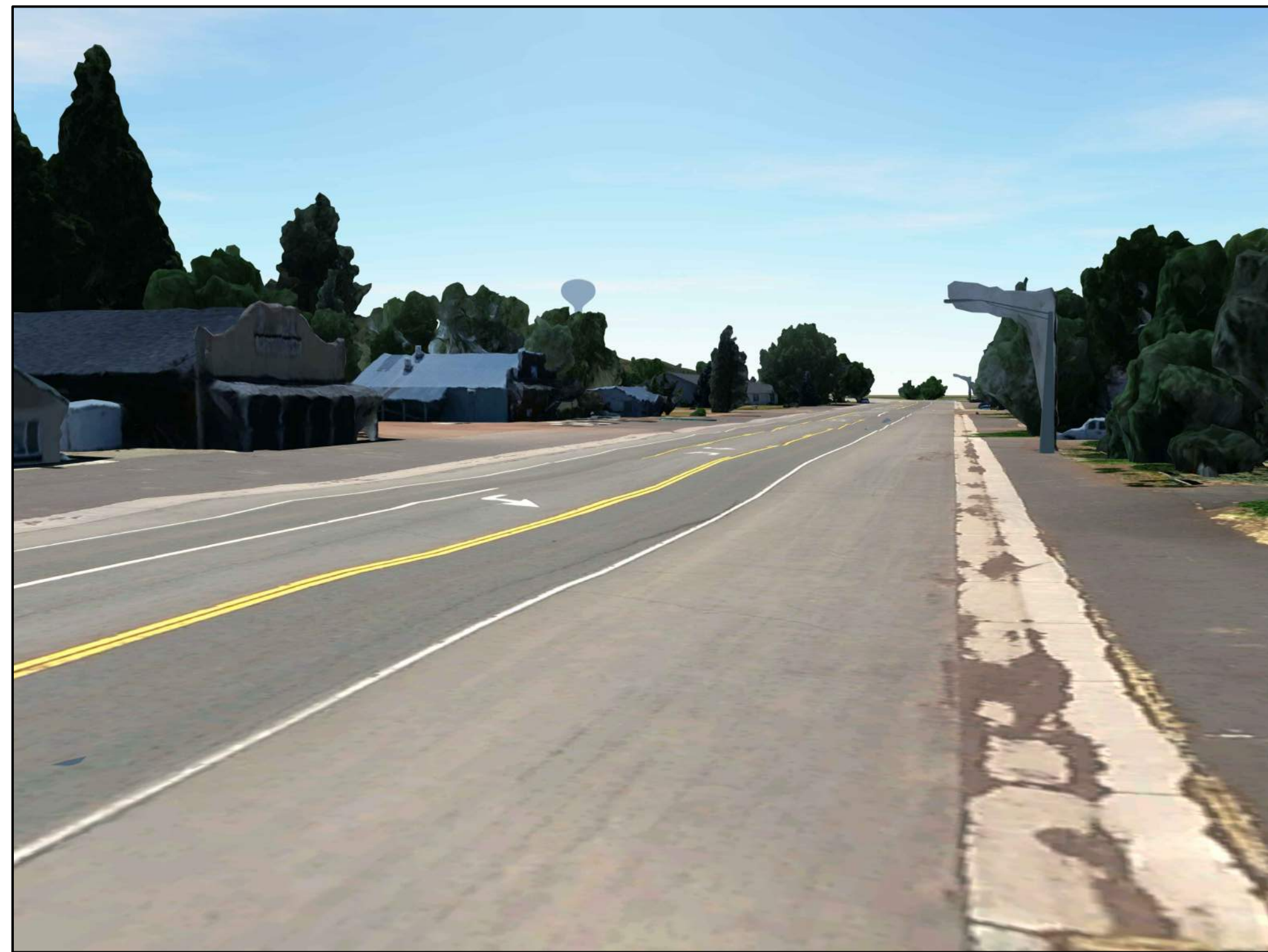
WESTBOUND ON 299 LOOKING WEST NTS (4) C1.0