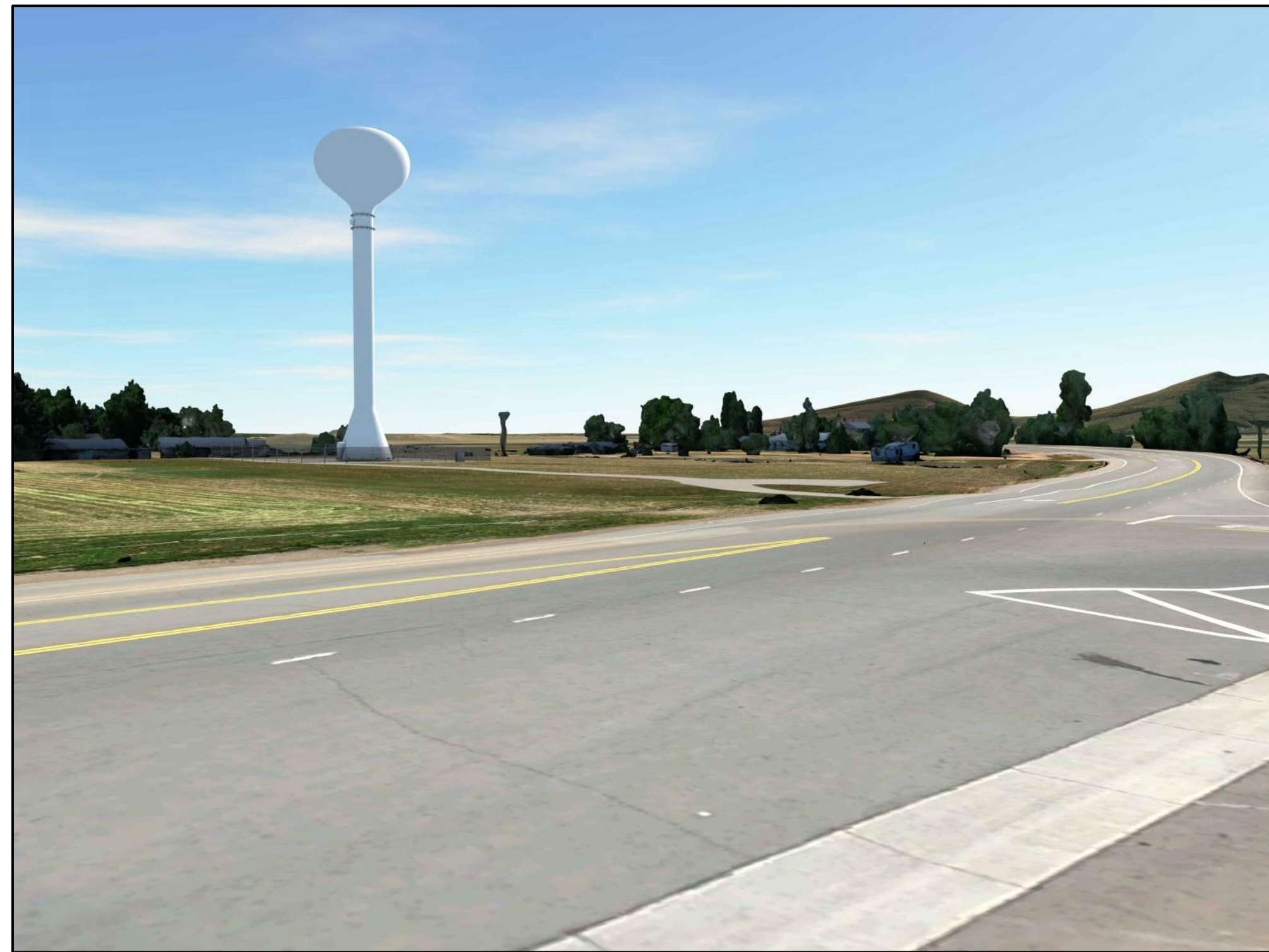
INTERSECTION OF MCARTHUR RD AND HYW 299 LOOKING SOUTHWEST NTS (1) C1.0