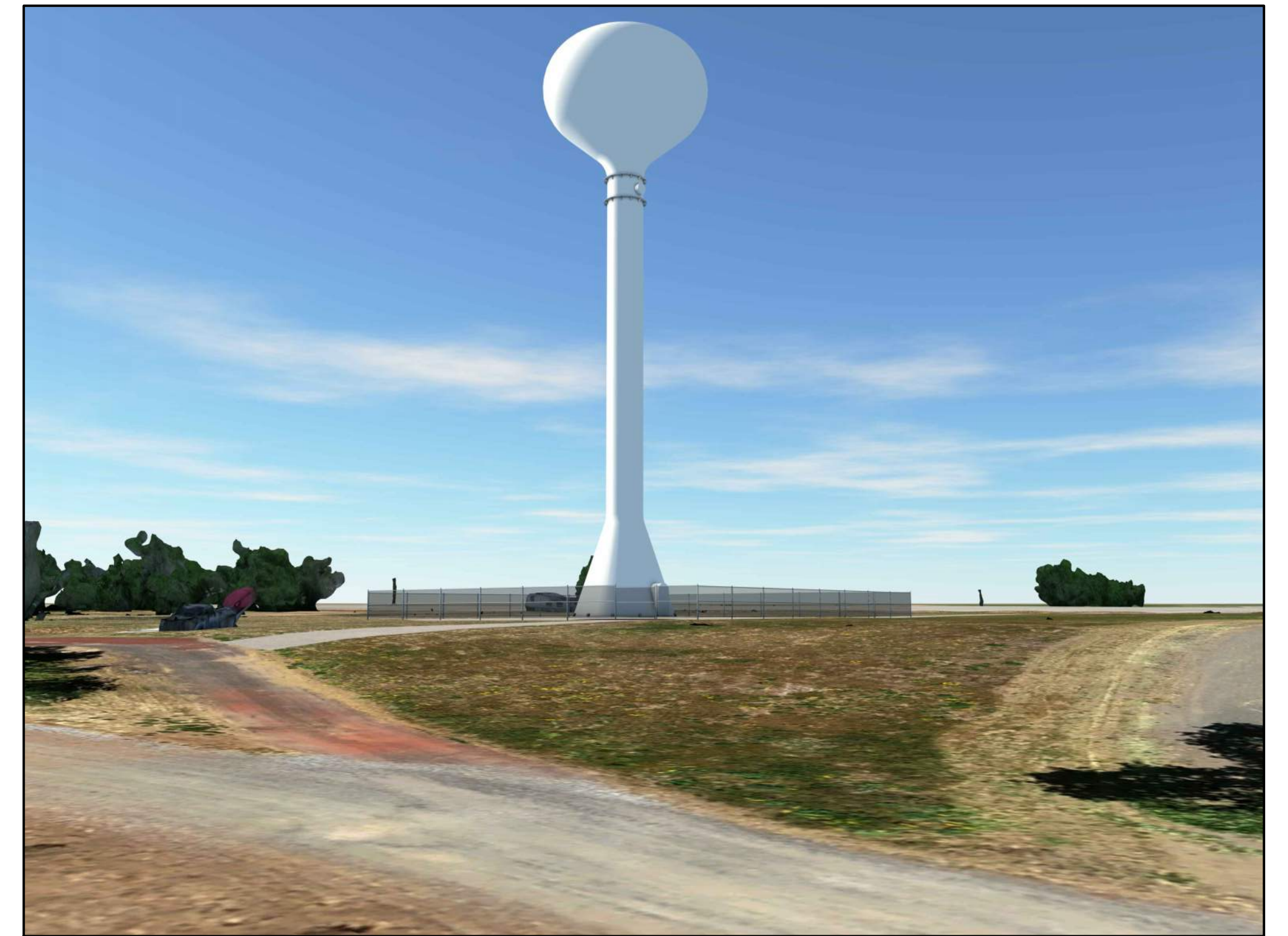
INTERSECTION OF OAK ST AND CEDAR ST LOOKING NORTHWEST NTS (3) C1.0