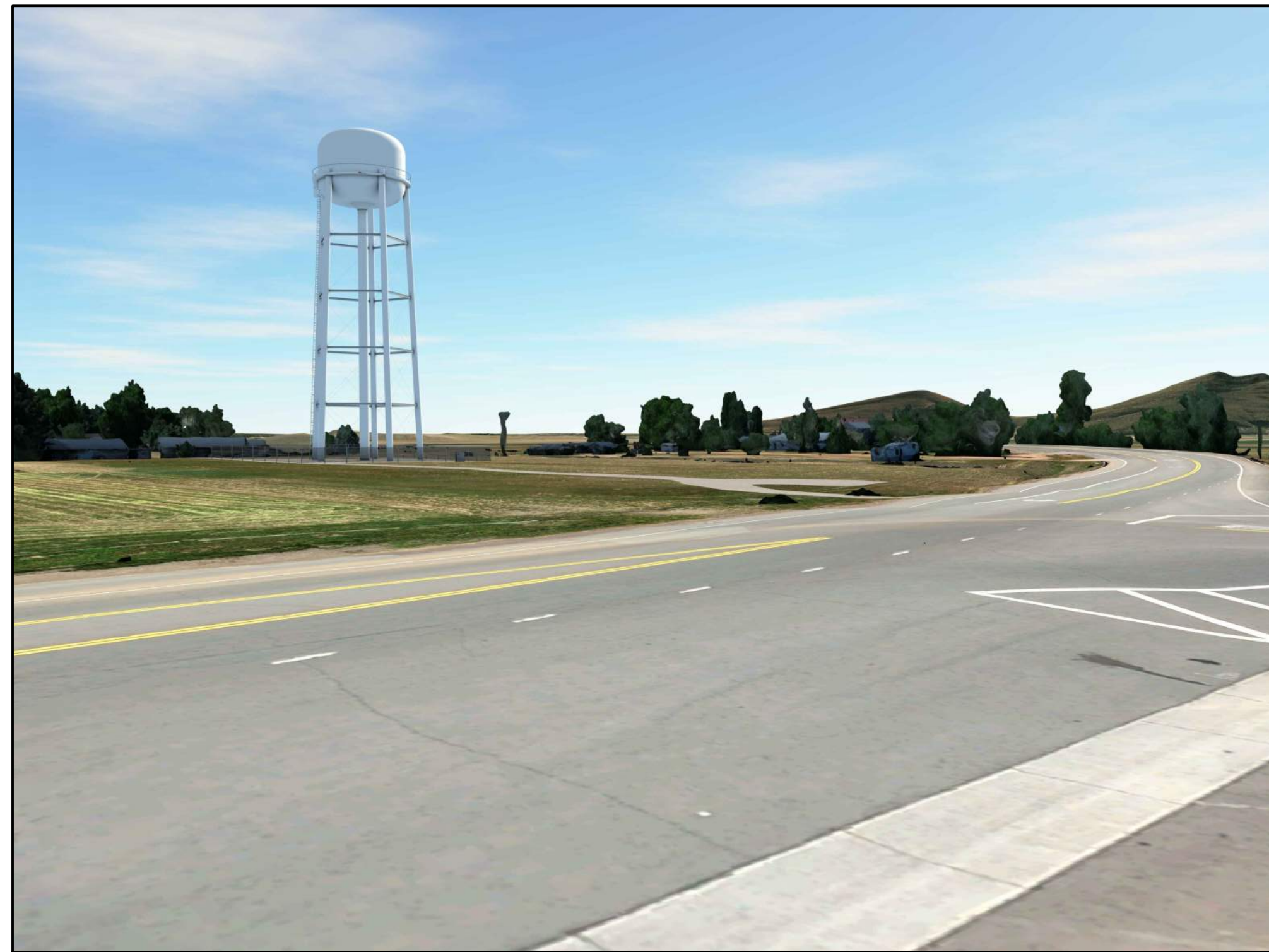
INTERSECTION OF MCARTHUR RD AND HYW 299 LOOKING SOUTHWEST NTS (1) C1.1