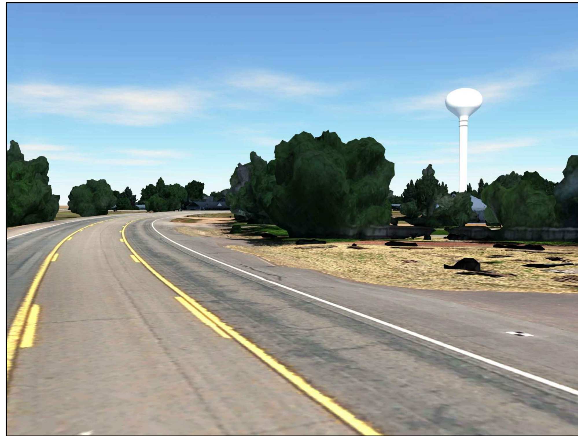
EASTBOUND ON 299 LOOKING EAST NTS (2) C1.0