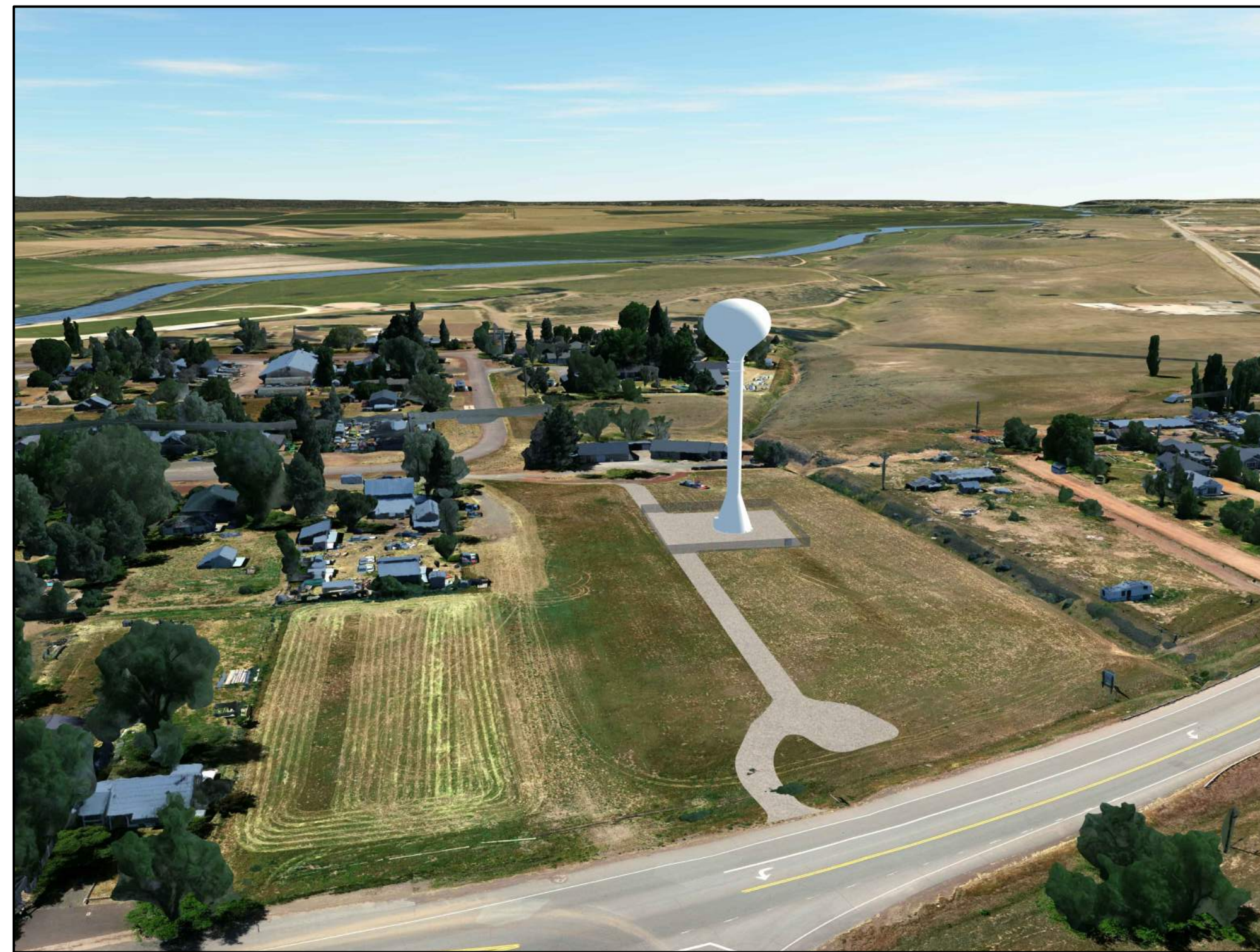
AERIAL PERSPECTIVE LOOKING SOUTHWEST NTS (5) C1.0