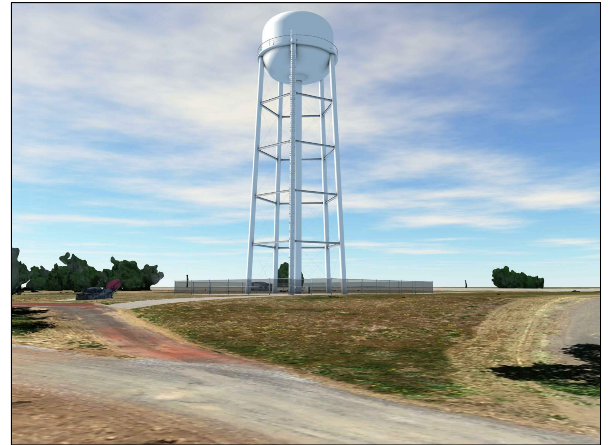
INTERSECTION OF OAK ST AND CEDAR ST LOOKING NORTHWEST NTS (3) C1.1