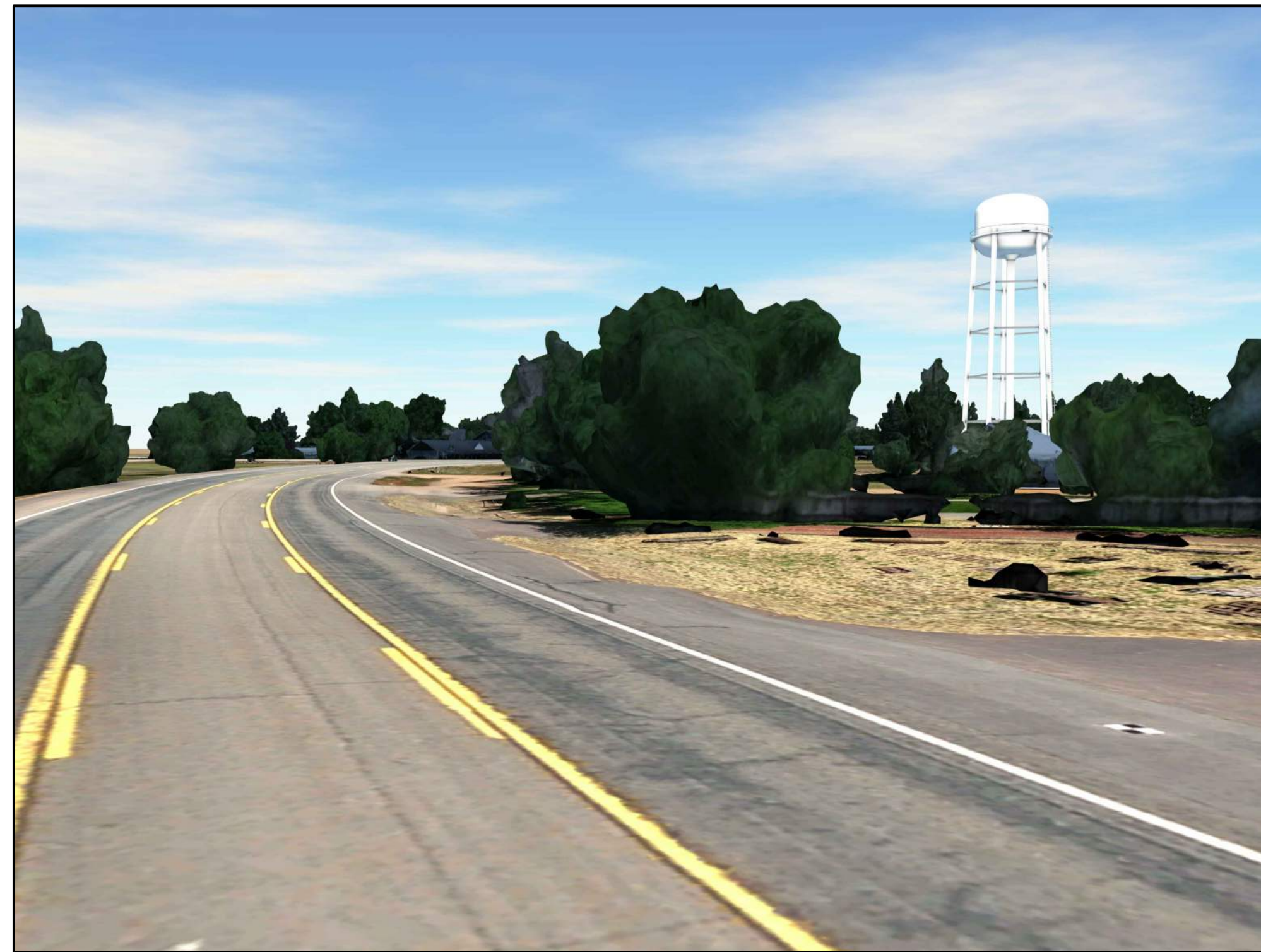
EASTBOUND ON 299 LOOKING EAST NTS (2) C1.1