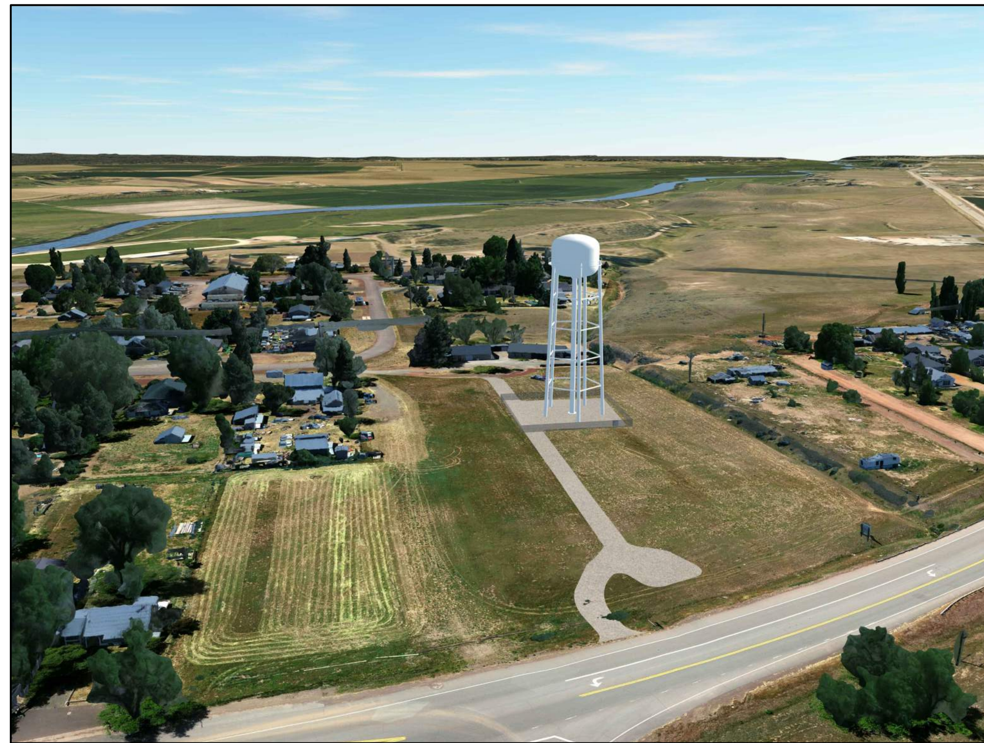
AERIAL PERSPECTIVE LOOKING SOUTHWEST NTS (5) C1.1