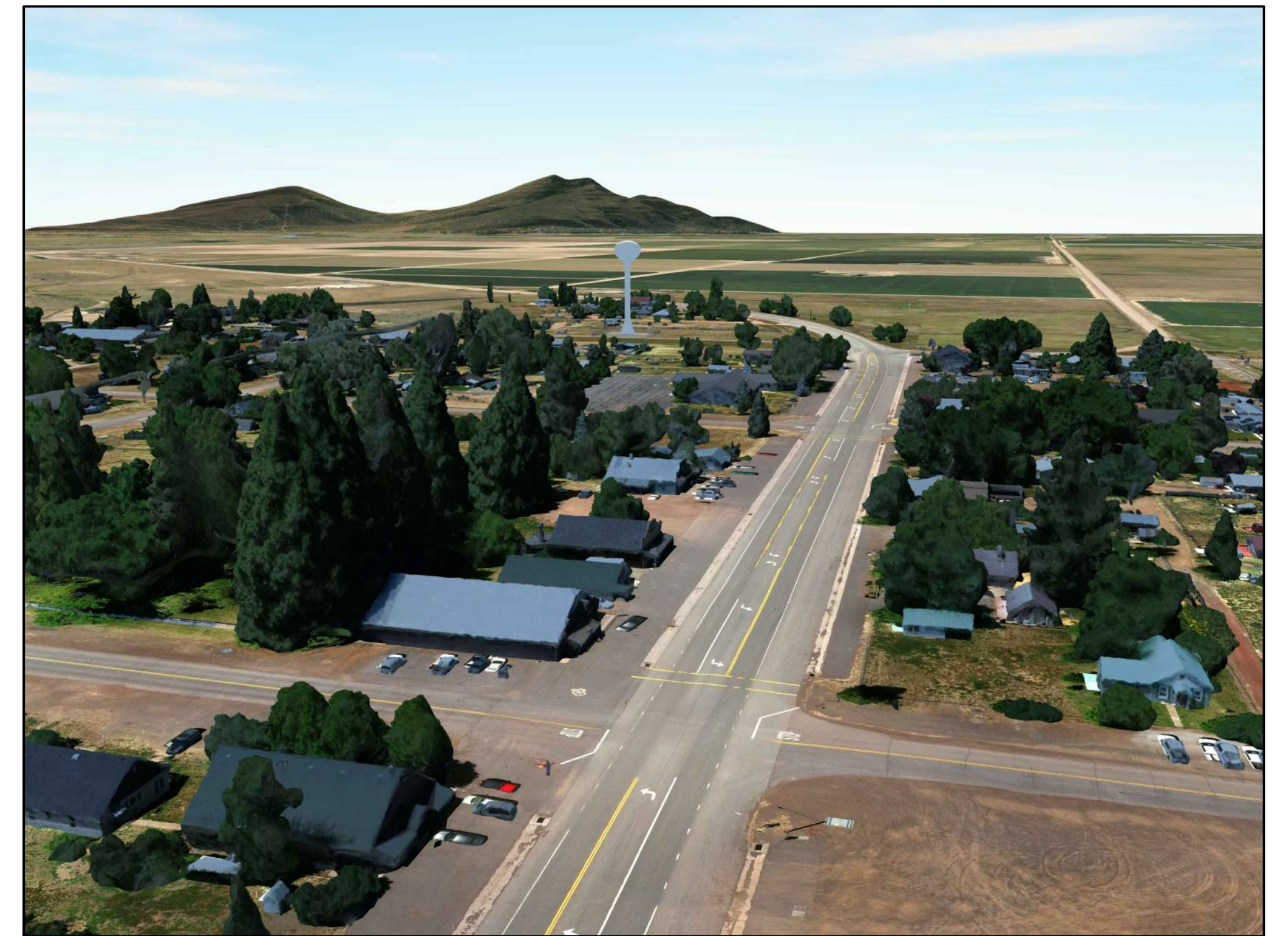
AERIAL PERSPECTIVE LOOKING WEST NTS (6) C1.0